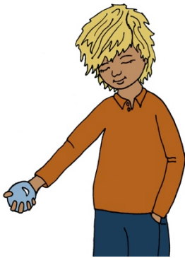
Squeeze a Ball