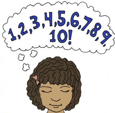
Count to Ten