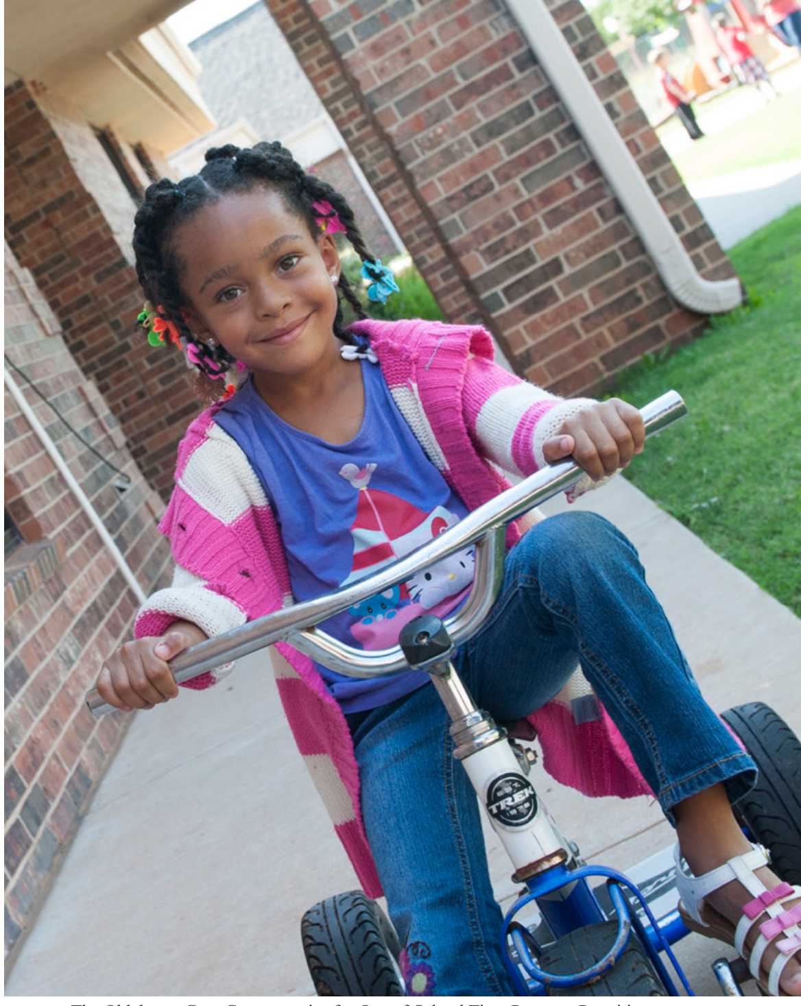
The Oklahoma Core Competencies for Out-of-School Time Program Practitioners

Military Child, Youth and School Services